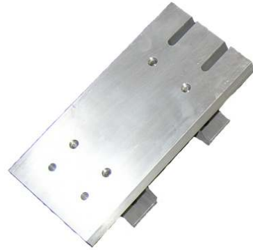
Bleed Down Valve Seal Insertion and Removal Tools Kit 302016-1